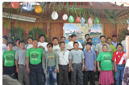
Bible school students share special music during the closing worship service.

This month we’d like to start a series called, “Meet Our Flight Clients”. Our first featured client is the Swiss Mission in Peru, known to us as “Mision Suiza en el Peru”, or “MSP” for short. These folks are our neighbors who live about two miles up the road. The Swiss Mission, funded by a variety of evangelical believers and churches in Switzerland and Germany, has been here since the 1950’s. Its purpose is to train and equip pastors and Christian workers, especially those from ethnic groups living in the jungle. These workers will then be able to share the Gospel with those of their own villages, as well as those of other native Peruvian ethnic groups. To accomplish this goal, the MSP hosts two study cycles a year at their base, which becomes, for those four months, a Native Bible Institute.